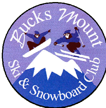
Our 41st Year

This Christmas we are traveling non-stop to Utah, staying in Park City. We